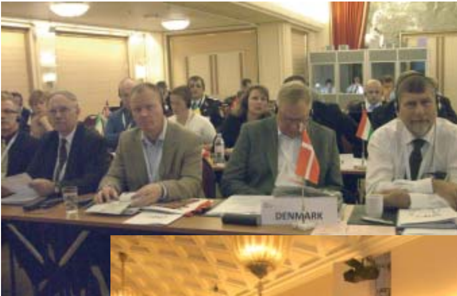
This year's Delegates Assembly took place in Bergen, Norway.